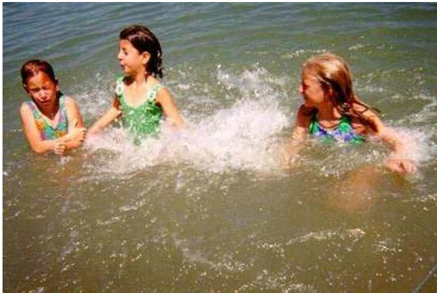
Three Girls in Dunrobin Lake